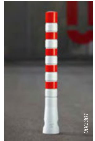
5 rings – powder-coated