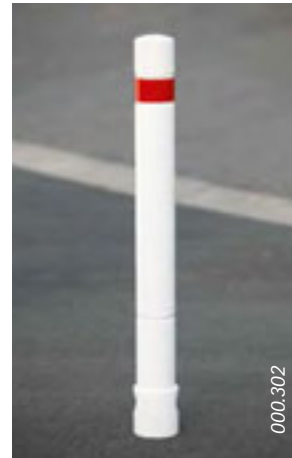
1 ring – powder-coated