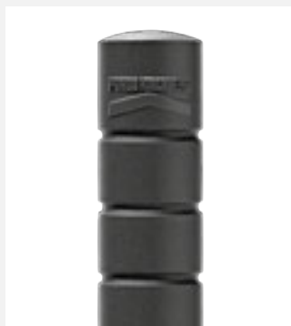
Luxembourg Fonds Kirchberg