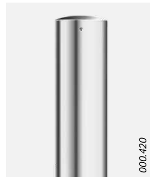
Stainless steel: electropolished/high-gloss