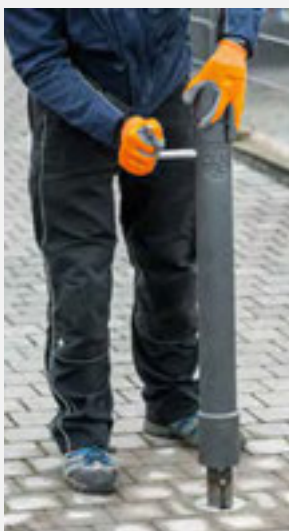
Easy and intuitive removal with little effort.

Self-latching fastening system for bollards. Quick positioning into the ground shell, easy removal without bending over.