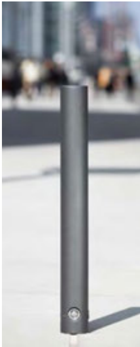
3p-Technology (Standard) (see pages 10–15)

3p-Technology is by far the most frequently ordered type of mounting. It is used in more than 85% of cases, because it significantly reduces costs.