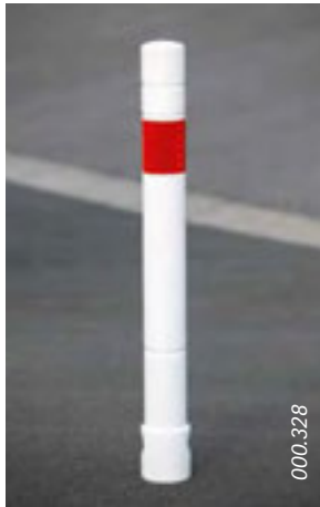
1 ring – reflective tape

Paintwork, reflective tapes, finishings, eyelets, chains etc. are available on request.