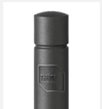
Luxexpo The Box