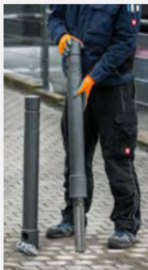
Bollards with junction pieces (3p-Technology) fit in the same ground shell.