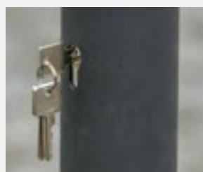
Available with triangular or cylinder lock