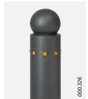
Cat's eye reflectors