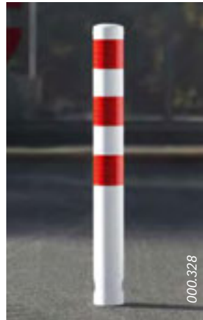
3 rings – reflective tape