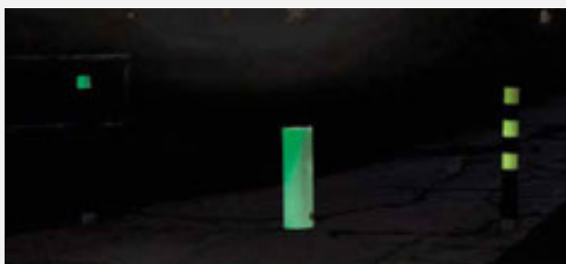
Above: in daylight, below: in the dark

Many have experienced this before – while driving home by bike at night, a hidden obstacle unexpectedly appears. Without artificial lighting, such routes are particularly hazardous.