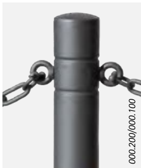
With eyelets & chain