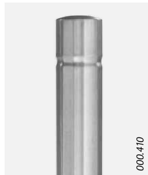
Stainless steel: smoothed, grain 240 (standard)